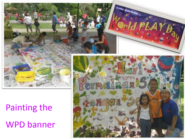
Painting the WPD banner