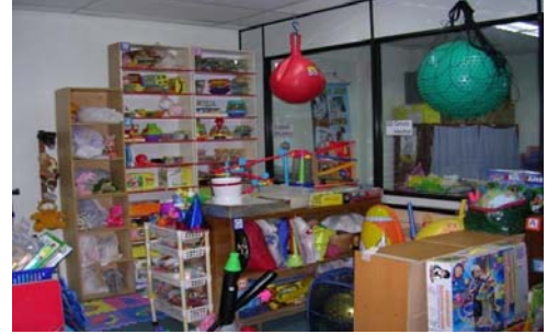
Photo of toy library store-house