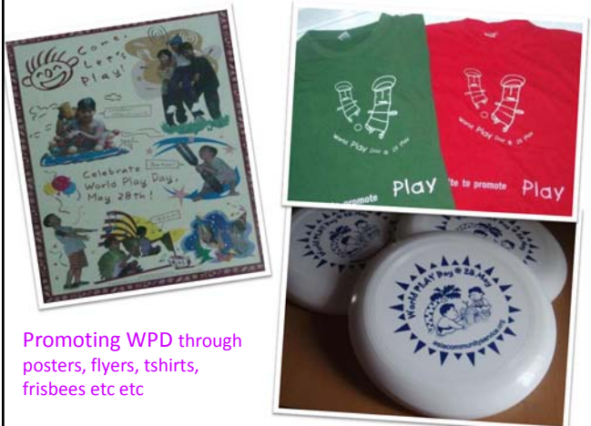
Promoting WPD through posters, flyers, tshirts, frisbees etc etc